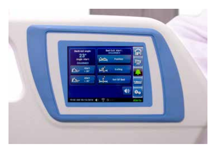
3-Mode Bed Exit Alarm