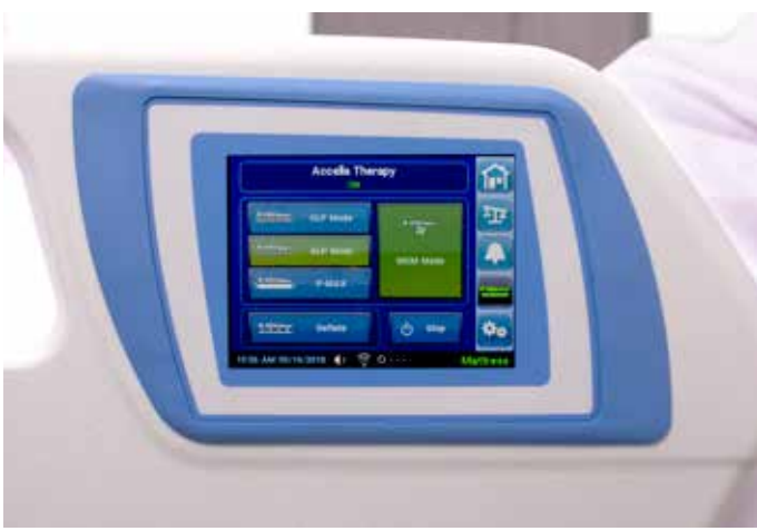
Accella Therapy integrated surface controls