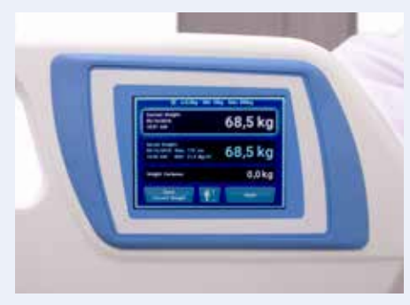
Simple Weigh in-bed scale

Optional in-bed x-ray, via a selection of Hill-Rom therapeutic surfaces and frame accessory